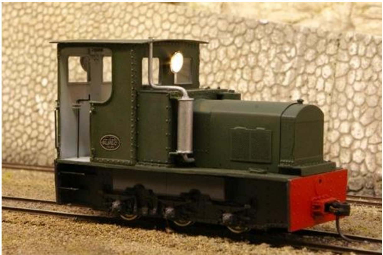
Oe scale model of a locotracteur Billard T80D (1:43,5).

As a donor locomotive and chassis for the 1:87 H0e scale model, I used a Fleischmann Piccolo type 7218 diesel shunting locomotive. This is a six-wheel model that corresponds reasonably well to the axle layout of the desired prototype. However, the axleboxes and springs on the frames of this model do not correspond very well with those of the T80D.