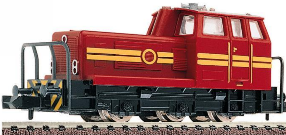
Fleischmann Piccolo shunting loco, type 7218.

As a donor locomotive and chassis for the 1:87 H0e scale model, I used a Fleischmann Piccolo type 7218 diesel shunting locomotive. This is a six-wheel model that corresponds reasonably well to the axle layout of the desired prototype. However, the axleboxes and springs on the frames of this model do not correspond very well with those of the T80D.