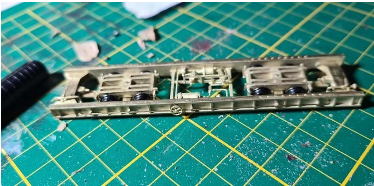
An article about my Coferna diesel locomotive in 0e appeared in the club magazine of the 7mm Narrow Gauge Association, Narrow Lines.